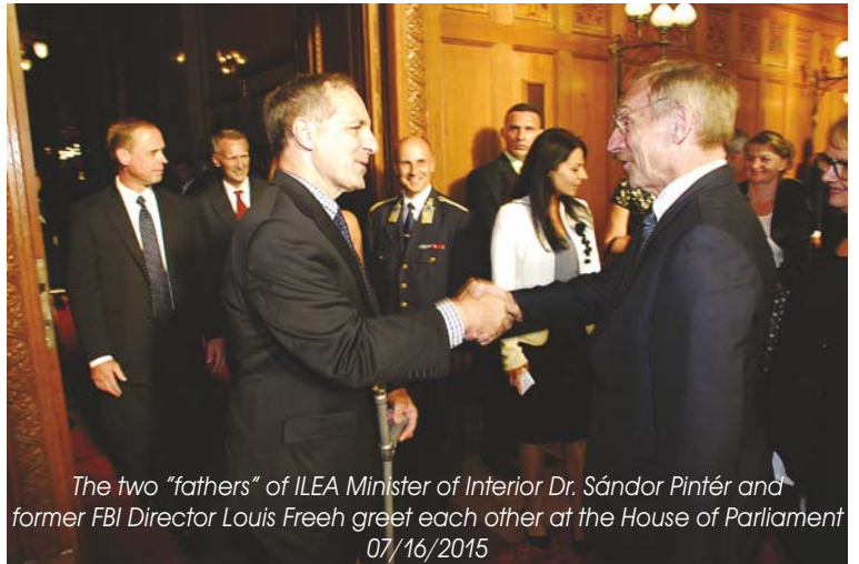
The two “fathers” of ILEA Minister of Interior Dr. Sándor Pintér and former FBI Director Louis Freeh greet each other at the House of Parliament 07/16/2015

On July 17, we continued celebrating the 20th Anniversary